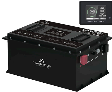
51.2V 100Ah & Real Time Monitor