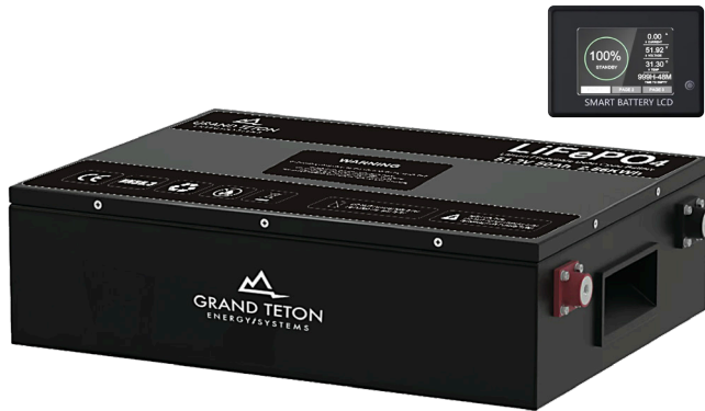
51.2V 50Ah & Real Time Monitor