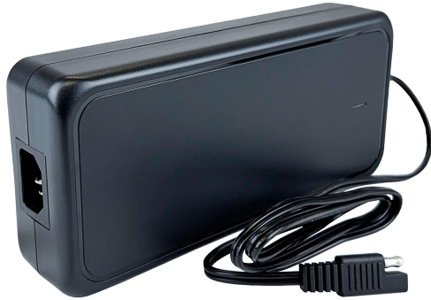
Li-ion Smart Charger