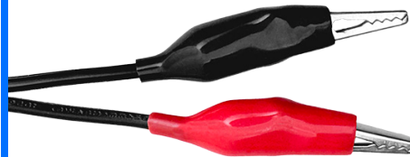
03 Alligator Clips