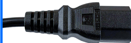
IEC 60320 C13