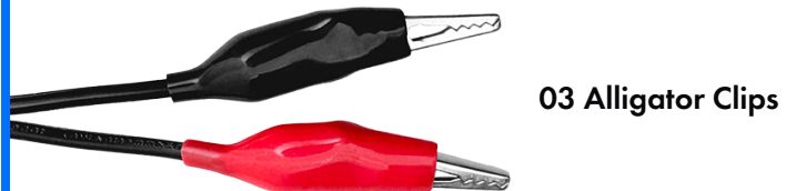
03 Alligator Clips