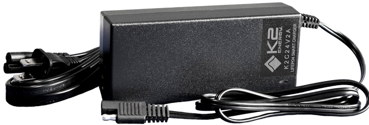
Li-ion Smart Charger