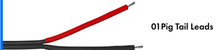
01 Pig Tail Leads