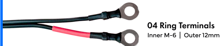
04 Ring Terminals Inner M-6 | Outer 12mm