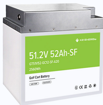
51.2V 52Ah - Replaces GC12 (12V)